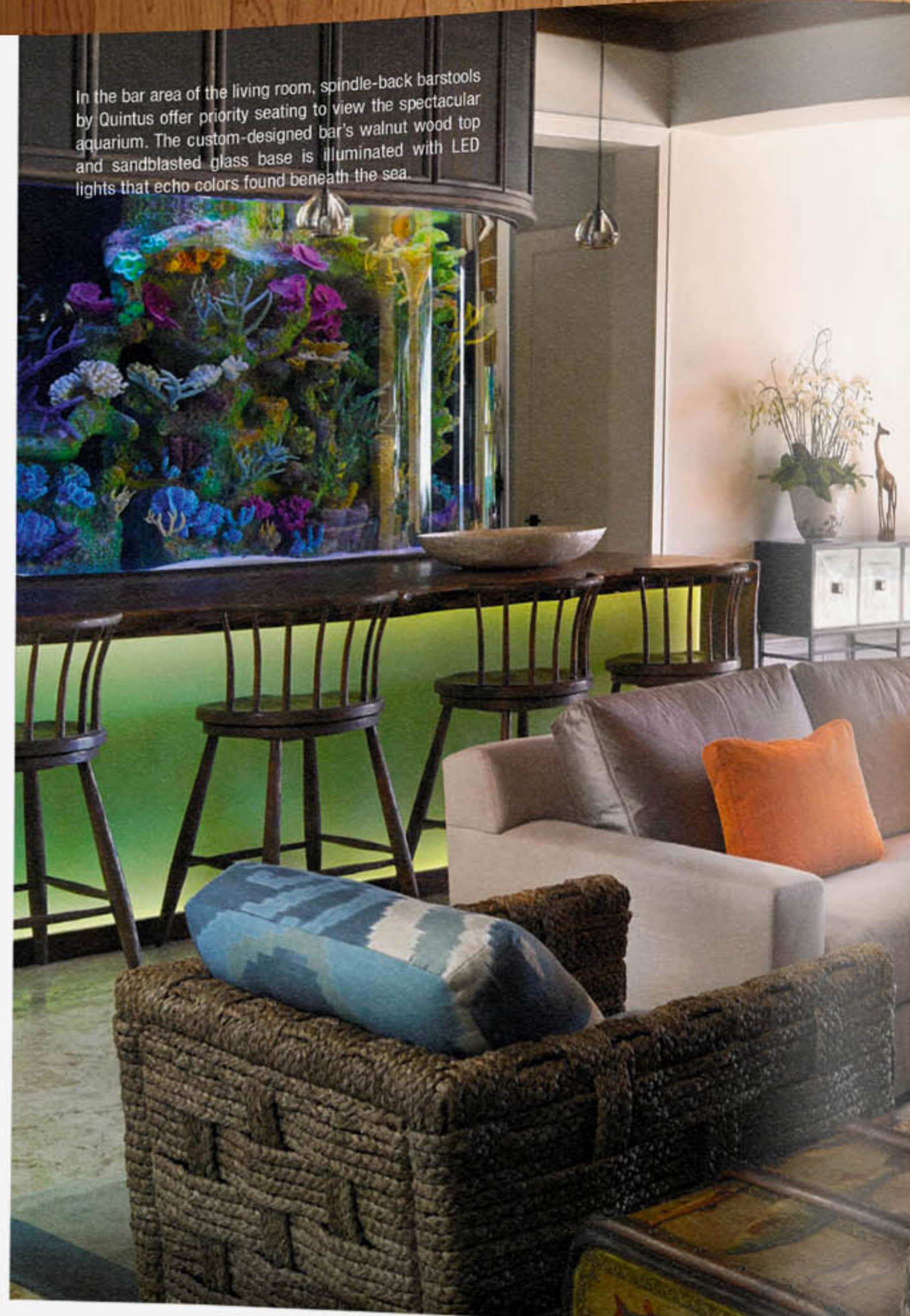
In the bar area of the living room, spindle-back barstools by Quintus offer priority seating to view the spectacular aquarium. The custom-designed bar's walnut wood top and sandblasted glass base is illuminated with LED lights that echo colors found beneath the sea.

In the nearby kitchen, the marine motif continues with a backsplash of floating, 50-million-year-old fossil fish from Eostone that seems apropos for a couple who makes their living as geologists. An oversized center island custom designed by UMI is topped with a natural blue and white stone, which resembles an aerial view nautical map of Florida and the Bahamas. Traditional elegance is found in Ruffino's cabinetry crafted with a mix of washed oak and dark walnut — organic woods that pull warmth into the space. Eclectic style emanates from every corner of the living room. The designer started simply with a soft, light-gray linen sectional sofa from Christian Liaigre,