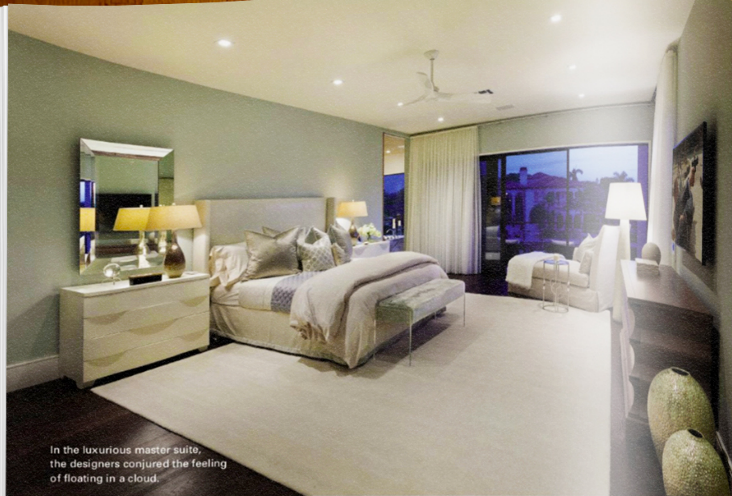
In the luxurious master suite, the designers conjured the feeling of floating in a cloud.