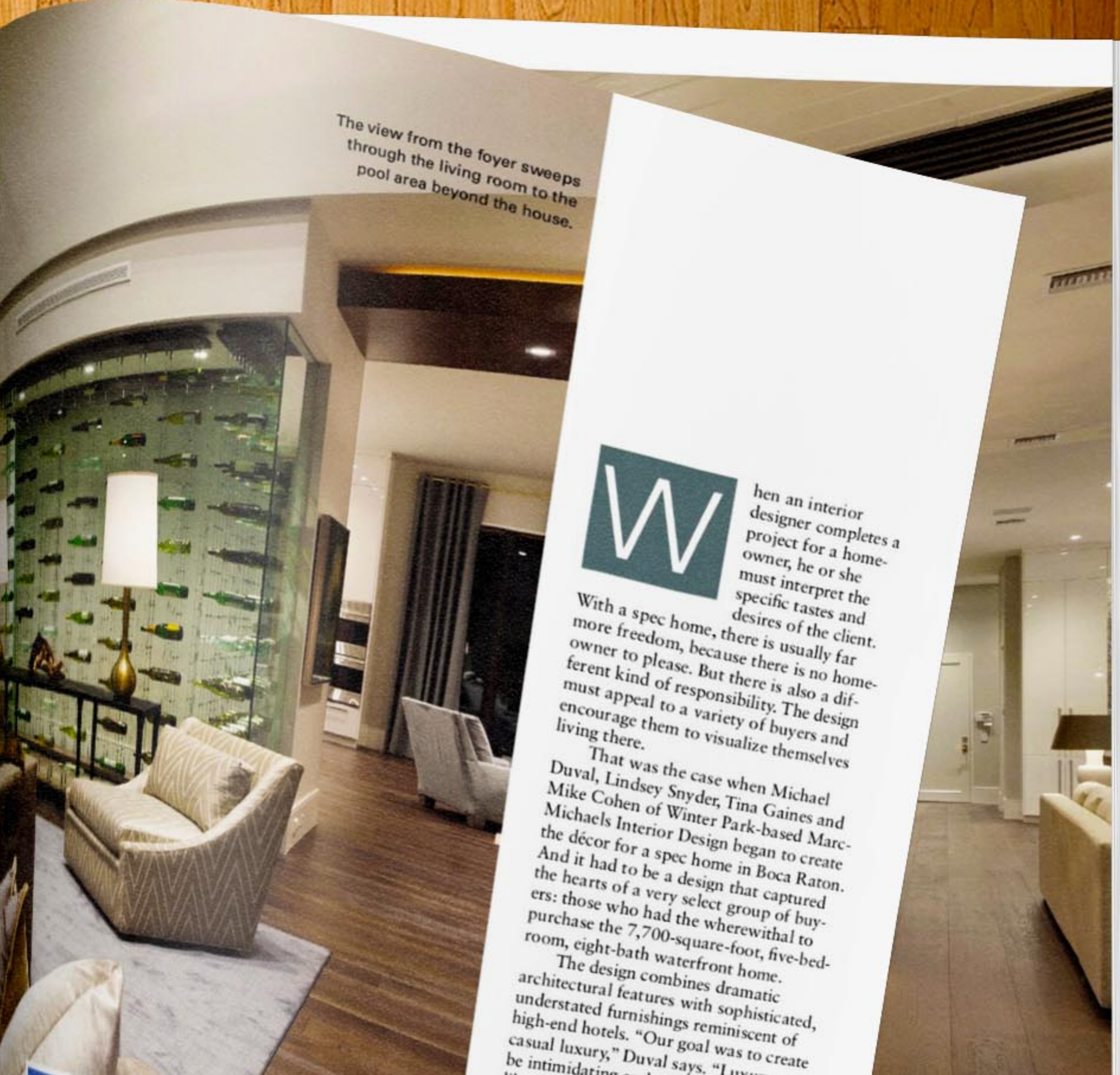
The view from the foyer sweeps through the living room to the pool area beyond the house.

W hen an interior designer completes a project for a homeowner, he or she must interpret the specific tastes and desires of the client. With a spec home, there is usually far more freedom, because there is no homeowner to please. But there is also a different kind of responsibility. The design must appeal to a variety of buyers and encourage them to visualize themselves living there.