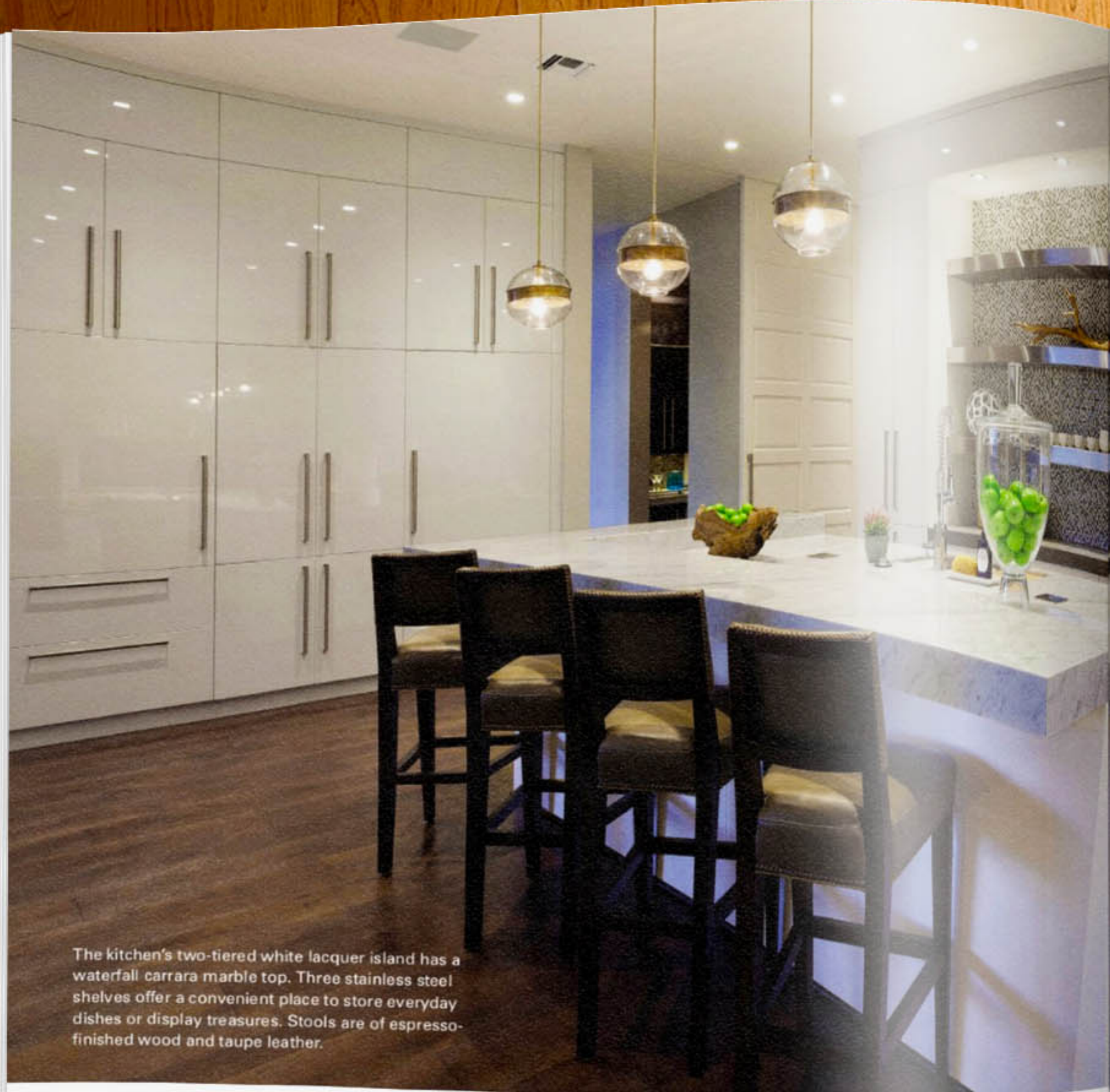
The kitchen's two-tiered white lacquer island has a waterfall Carrara marble top. Three stainless steel shelves offer a convenient place to store everyday dishes or display treasures. Stools are of espresso-finished wood and taupe leather.

designers created a cozy, intimate space for family gatherings and entertaining. A rust-and-bronze painted inset in the ceiling mirrors the shape of the table below. Hanging from the inset at different levels are five hand-blown spherical glass light fixtures in metal cages.