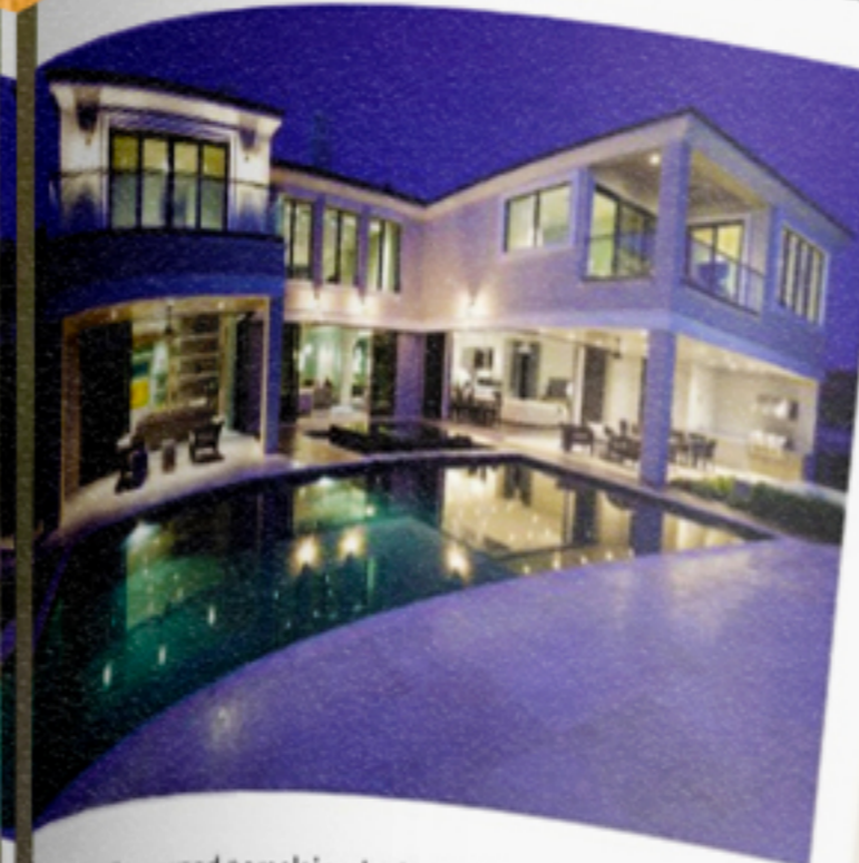
Faux-wood porcelain plank tile that matches the wood flooring inside the house covers the pool deck. Outdoor seating groups, including a custom fire pit, offer multiple spots for conversation and exterior lighting creates a dramatic sight at night.