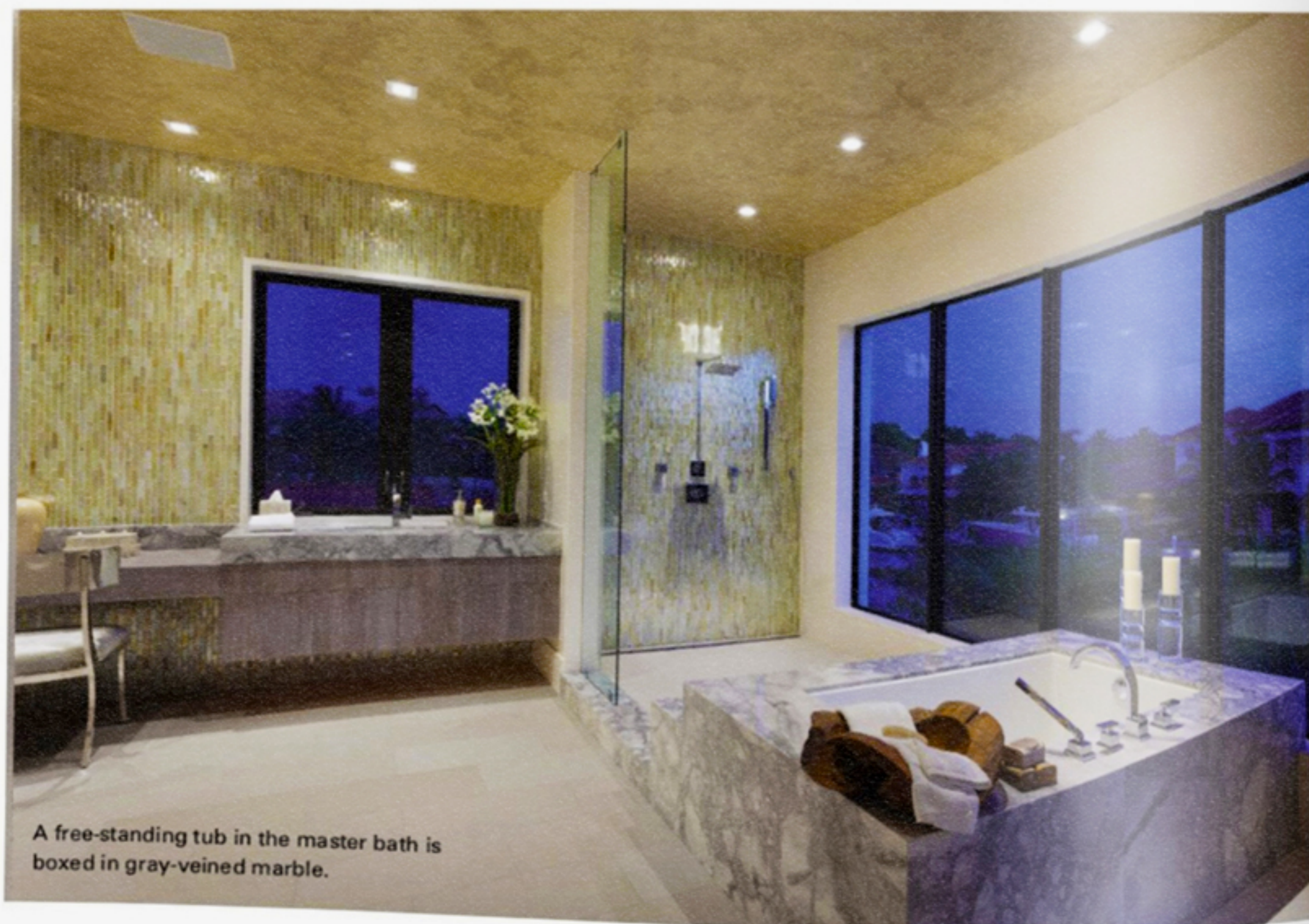
A free-standing tub in the master bath is boxed in gray-veined marble.