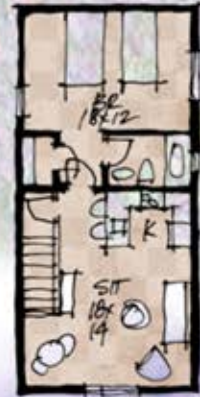
Staff (2 ND Floor)