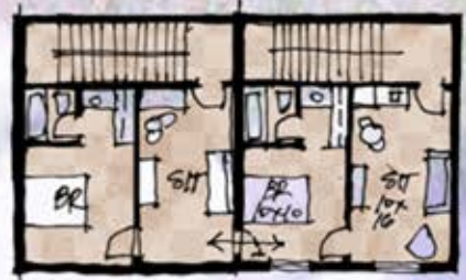
Optional Shared Staff/ Staff (2 ND Floor)