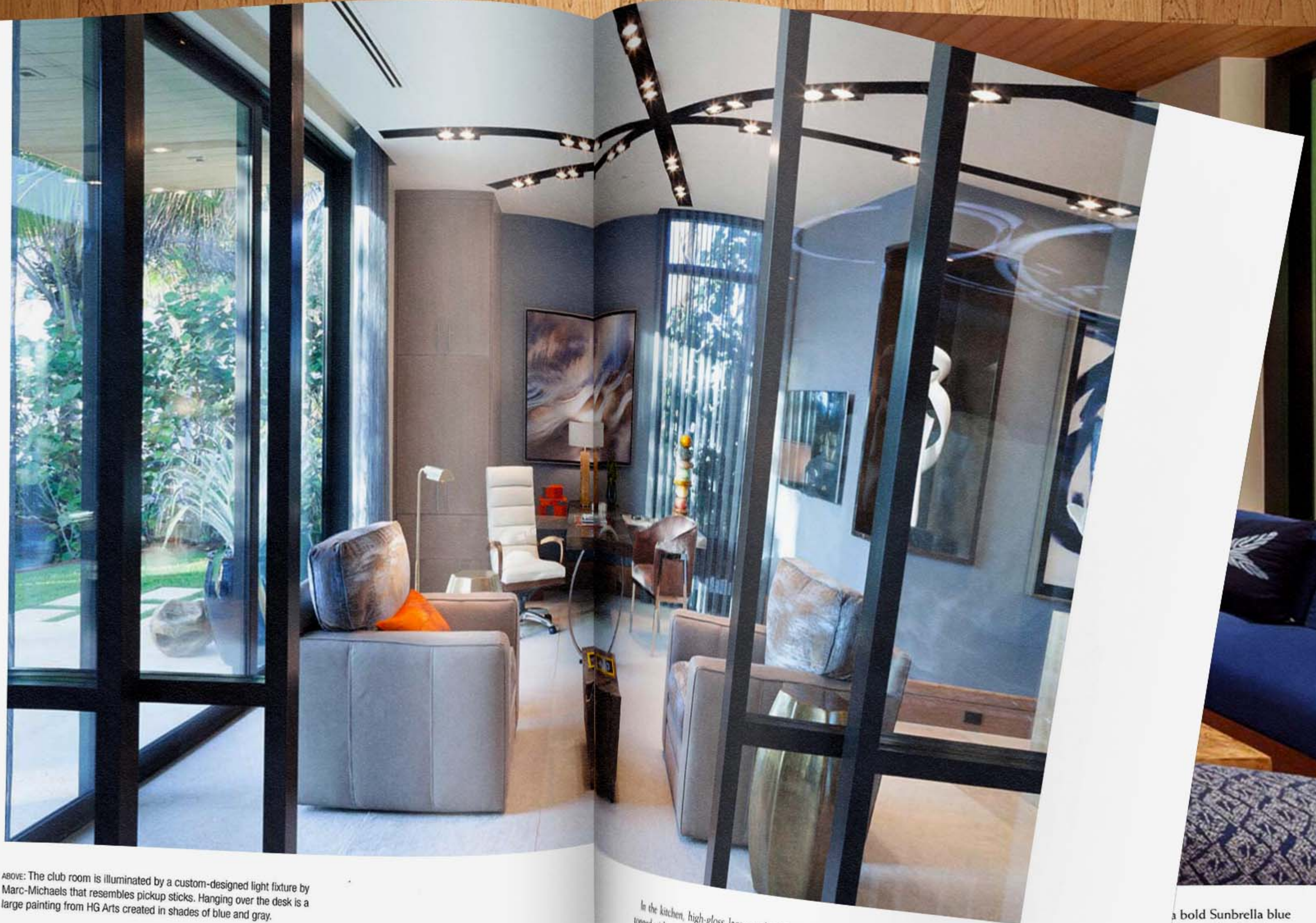
ABOVE: The club room is illuminated by a custom-designed light fixture by Marc-Michaels that resembles pickup sticks. Hanging over the desk is a large painting from HG Arts created in shades of blue and gray.

In the kitchen, high-gloss lacquered cabinetry, created by Superior Wood Products, is topped with an aqua-colored glass counter that appears almost translucent, and lends Mid-century modern appeal. Against a wall, open walnut shelving is perfect for displaying casual china. Barstools from Vanguard clad in a Kravet fabric tuck neatly beneath a spacious breakfast island covered with a living-edge walnut counter that echoes the entry door. To design the club room, Thee chose furnishings and accents that suggest the colors of the sea and sky. A pair of blue-gray leather armchairs from Lee Industries offer a quiet place to